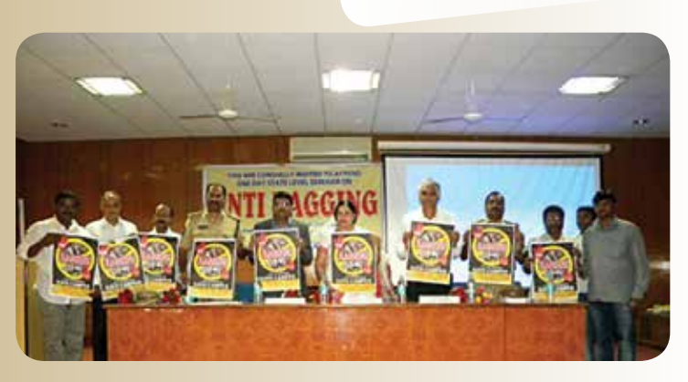
Anti-ragging campaign launched at IPE