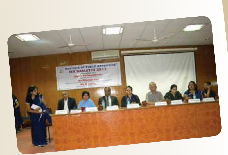
HR SAMATHI inaugurated