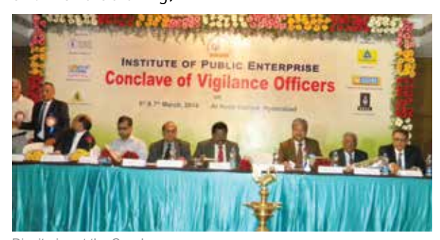
Dignitaries at the Conclave

A 'Conclave of Vigilance Officers' was held on 6th & 7th March 2014. The presentation ceremony of 'IPE's Vigilance Excellency Awards - 2014' to many renowned CPSEs and Banks also take place during the occasion. Companies that participated included: HAL, RINL, RCF, Neyveli Lignite, MIDHANI, ECIL, Cotton Corporation, FACT, ALMCO, SIDBI, Canara Bank, Punjab National Bank, State Bank of India - Hyd, Allahabad Bank, Mahanadi Coalfields, Northern Coalfields, and Central Coalfields. A commemorative souvenir on this occasion was brought out with received messages from the then CM (Gujarat) Sri Narendra Modi CM, Sri Akhilesh Yadav CM (UP), Smt Vasundara Raje CM (Rajasthan), HE Shekhar Dutt Governor (Chhattisgarh) HE MK Narayanan Governor (WB), and CMDs of many organisations. Participation of 5 CMDs, 25 CVOs (IAS/IPS/IRS/IFS), and many senior vigilance personnel was the highlight of this conclave. Speakers applauded IPE's initiatives in creating a unique platform for sharing of experiences in various sectors (Banking, Mining and Manufacturing).