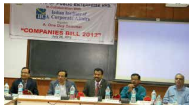
Dignitaries at the Programme on Companies Bill

The Program was attended by 26 participants from various private and public sector organizations including West Fargo, Shanta Biotech, Nava Bharat Ventures, ONGC, BHEL, HUDCO, BDL etc.