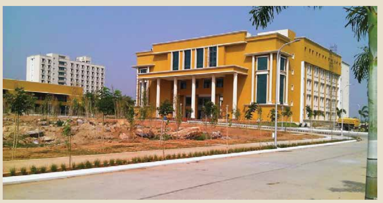
New Academic Block

To further enhance the scope of its activities, the Institute is expanding its infrastructure facilities by building a new residential campus at Shameerpet village, on the outskirts of Hyderabad. The sprawling 17-acre campus is located in a peaceful locality, surrounded by a reserve forest on one side and the beautiful Shameerpet lake on the other. With a total built-up area of 5.50 lakh sft, the campus will house a state-of-the-art academic block, an administration block, a modern library, an MDP block, a food court, an auditorium and several sports facilities. It will also have comfortable facilities to accommodate 600 boys and 400 girls.