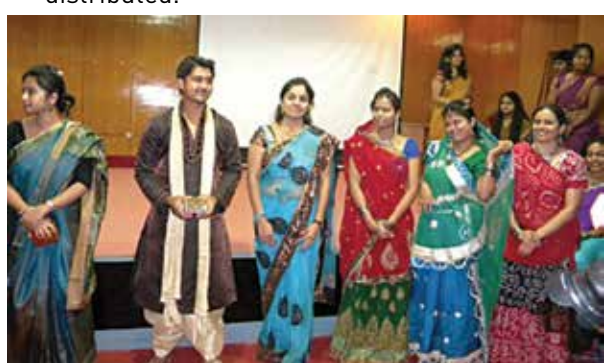
Ethnic Day at IPE

Students of the Institute of Public Enterprise organized Ethnic-Day on 1 November, at IPE, OU Campus. Students and employees arrived in traditional attires. Rangoli, Dancing and Singing competitions were conducted and prizes were distributed.