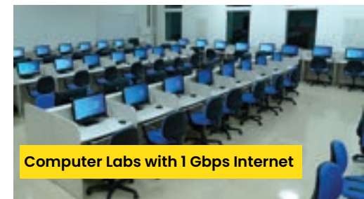
Computer Labs with 1 Gbps Internet

*The institute will issue a certificate of participation on the concluding day of the Programme.