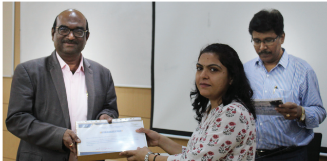
Presentation of Certificate to one of the Participants