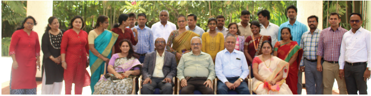
Management of Individual Behaviour for Social Good [Sponsored by ICSSR]