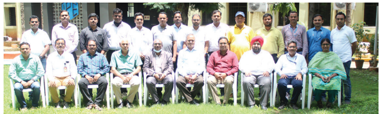
Participants of 'Operations and Supply Chain Analytics for Competitive Advantage' Programme