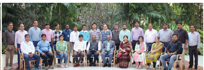
'IMPACT - Building Leadership Skills' Programme