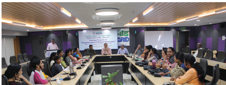
Empowerment of Women Employees for Power Grid Corporation of India Ltd Executives