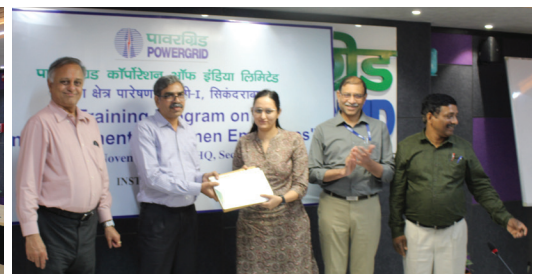
Certificate Presentation to the Participant in the Programme