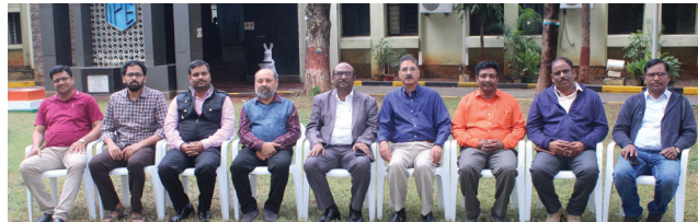
Participants of 'MDP on Finance for Non-Finance Executives' Programme