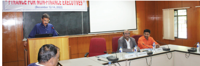
MDP on Finance for Non-Finance Executives