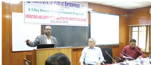
Programme on 'Operations and Supply Chain Analytics for Competitive Advantage'

With its rich and varied experience in designing and delivering training programs, IPE is well placed to impart new insights and inputs in the post pandemic world. The faculty members of IPE are equipped with innovative pedagogies during the sessions for impactful learning. The pandemic has enabled IPE to emerge stronger in conducting the management development programs in online and offline mode, which were highly appreciated. Given its ability to design and deliver the training programmes to suit the clientele needs, IPE stands at the vanguard in imparting management skills to the executives of the Public Enterprises.