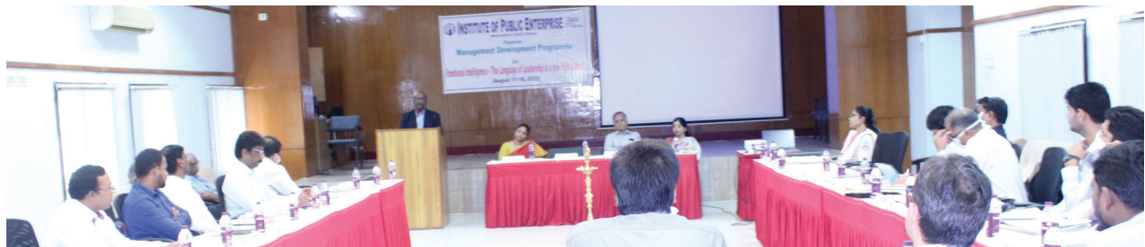
Emotional Intelligence – The Language of Leadership in a new Hybrid World