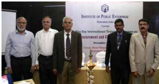
Inauguration - Public Procurement and Contract Administration