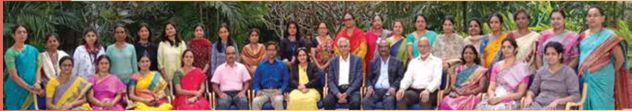
Participants of the 7 th National Conference "Diversity in Management - Development of Women Executives"