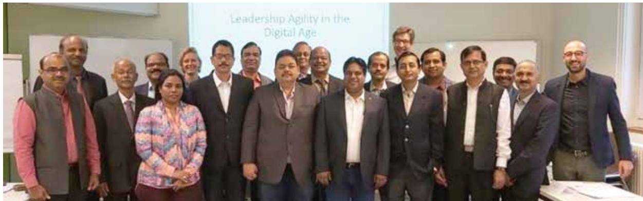
Participants of the Advanced Leadership Programme in Lausanne, Switzerland

With its rich and varied experience in designing and delivering training programs, IPE is well placed to impart new insights and inputs in the post pandemic world. The faculty members of IPE are equipped with innovative pedagogies during the sessions for impactful learning. The pandemic has enabled IPE to emerge stronger in conducting the management development programs in online and offline mode, which were highly appreciated. Given its ability to design and deliver the training programmes to suit the clientele needs, IPE stands at the vanguard in imparting management skills to the executives of the Public Enterprises.