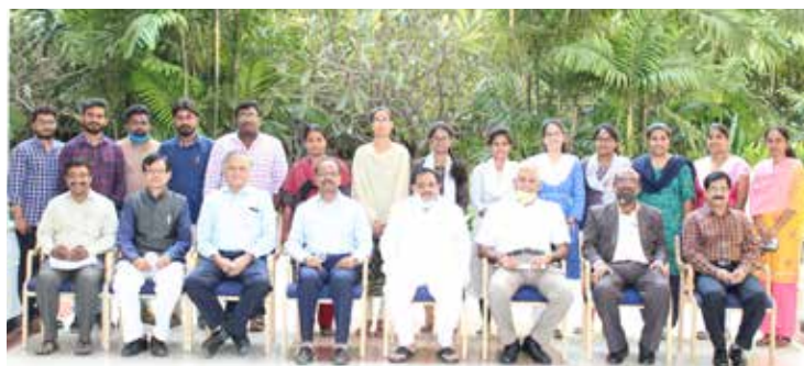
Soft Skills for Enhancing Managerial Competencies - TSSDCL