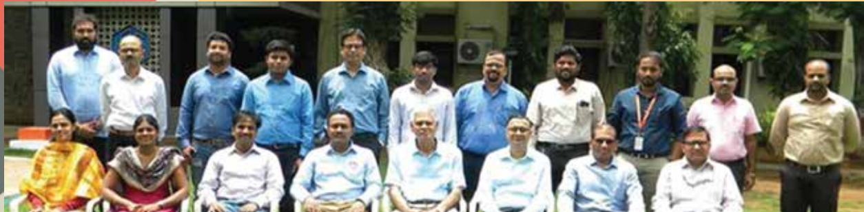
Participants of the training programme "Cyber Attacks and Cyber Security"