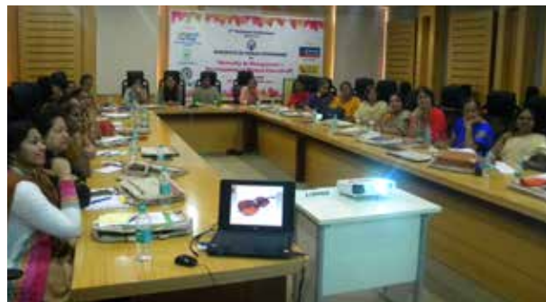
National Conference on Diversity in Management - Development of Women Executives