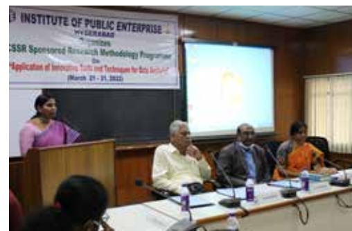
Inaugural - Research Methodology Programme