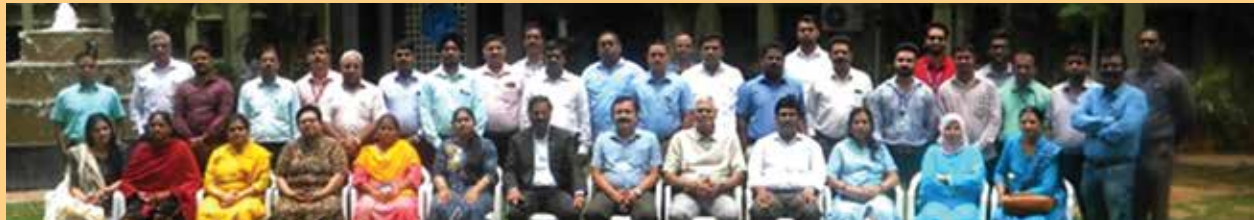
Participants of the training programme "e-procurement System for Vigilance and Transparency"