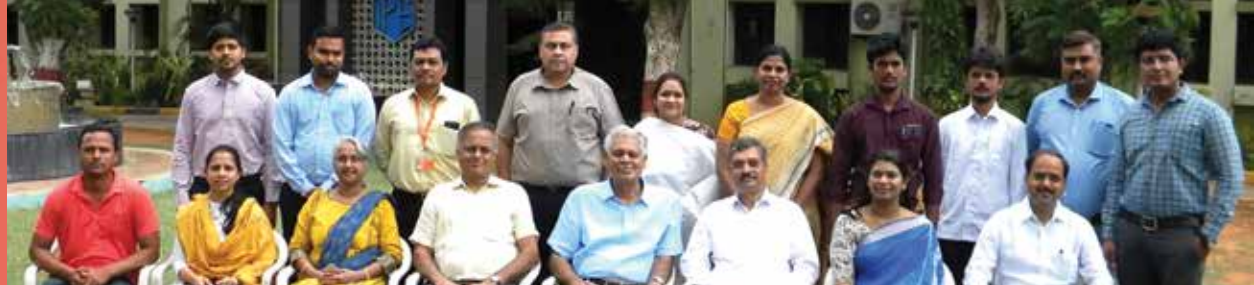
Participants of the training programme "Managing CSR in the Changing Paradigm"