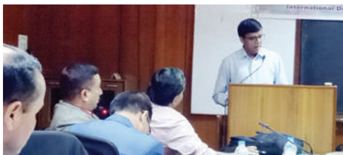
A Class in Progress

IPE organized a week-long study tour programme for a high level delegation from Advancing Life and Regenerating Motherland (ALARM), Myanmar during 24-31 November 2018 at IPE OU Campus, Hyderabad. There were 12 delegates that included political representatives, funding partners, army personnel and academicians from Myanmar who are working particularly in the area of Land & Environment Sectors and are a part of the Union Peace process. This study tour was