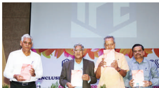
Book Release Function