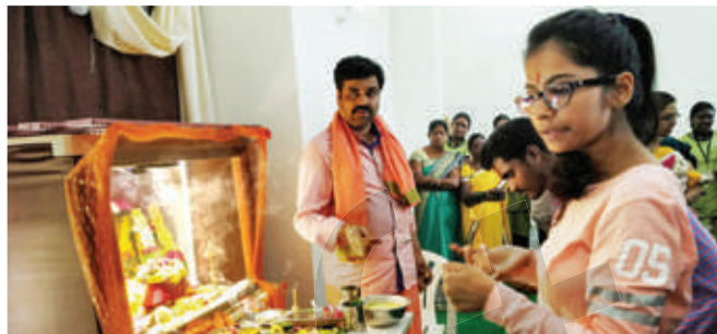
IPE students performing the Durga Puja