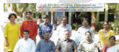
A group photograph of the programme