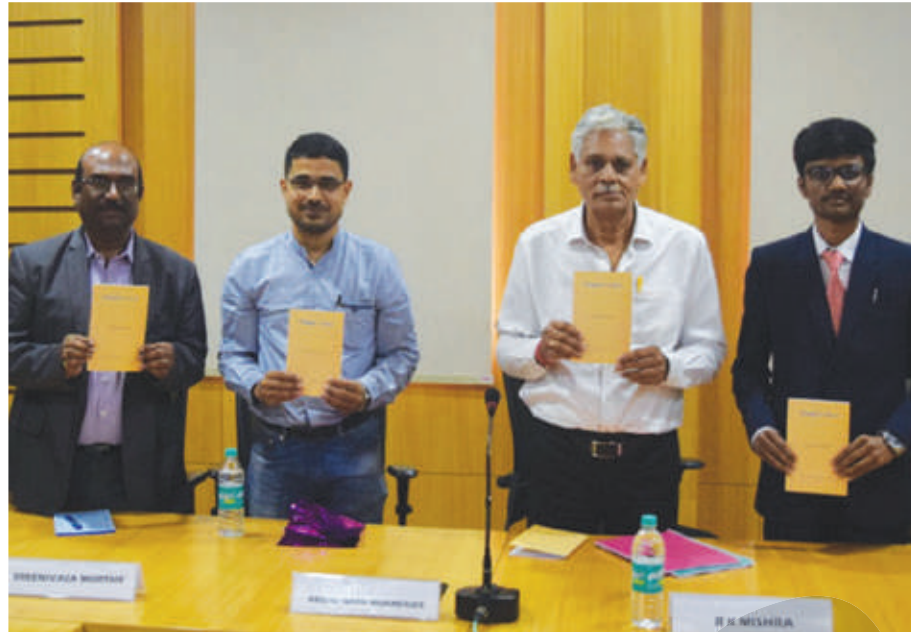
Book release function

Published by Jaishetty Publications, first edition features epic poetry from the dawn of modernity in the form of 10 poems,