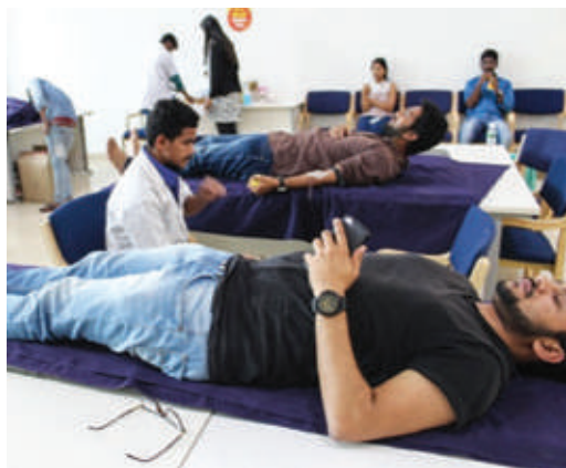
Blood donation camp in progress

IPE employees and students actively took part in this camp, volunteered and donated blood. Apart from a major chunk of IPE employees, 107 (in total) students donated blood during the camp. The blood so collected from the camp was sent to the children who had been suffering from Thalassemia and Sickle Cell disease.