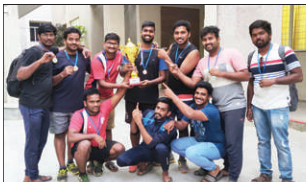
The winning IPE team showcasing the 'Winners Cup'