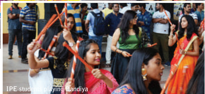
IPE students playing Dandiya

This year's Bathukamma festival was celebrated at IPE Shamirpet Campus on 10 October 2018 with much pomp and fervor. IPE Women faculty and students who gathered at six pillars in the evening celebrated the festival with a lot of enthusiasm. Flowers of different colours and species were arranged in a cone shape. The female students who formed in groups placed Bathukamma in the centre and danced around it symmetrically. By clapping the hands in unison they sang Bathukamma songs. To mark the event, IPE faculty and students also played 'Dandiya'.