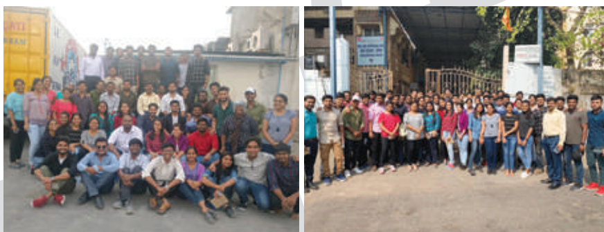
IPE students visiting the industries

The PGP junior students of 2018-20 batch, as part of the Annual Industrial Tour visited the following industries based at Hyderabad during 28 November - 19 December 2018: Namaste Telangana Newspaper and Chermas, Parle G & Masqati Dairy, Ganapati sugars, Bisleri, Finecab & RC Cola, Gandour & Tata Water, Tata Water, Berco, Stanza & Bailey water, Surya Masala & Raj Classics, ICD CONCOR and Tanza Apparels.