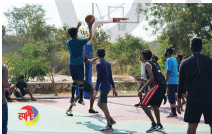
A point being scored in a basketball match