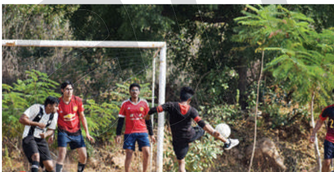
A goal being scored in a foot ball match