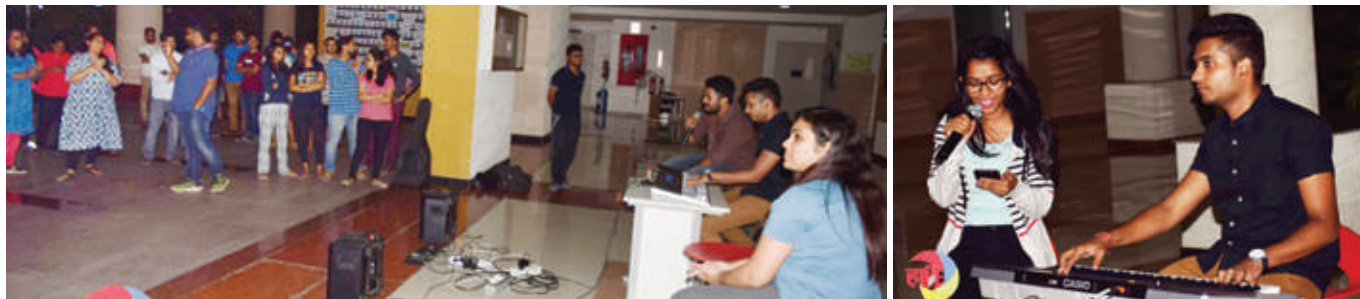
The Musical Night in full swing

A musical night of 'Celebration through Songs and Instrumental Music' was conducted by IPE students on 20 November 2018 at 'Six Pillars' of IPE Shamirpet Campus. The audience comprising mainly of both junior and senior PGP students of IPE were captivated by their fellow student-musicians and student-singers by orchestrating different instrumental music and singing various super hit songs. Those budding artists emulated the legendary musicians and showed that they were not short of talent and spirit to excel. In toto, during that night, the 'Six Pillars' became the epicenter of musical performances and singing talents and the audience were enthralled by these exceptional performances.