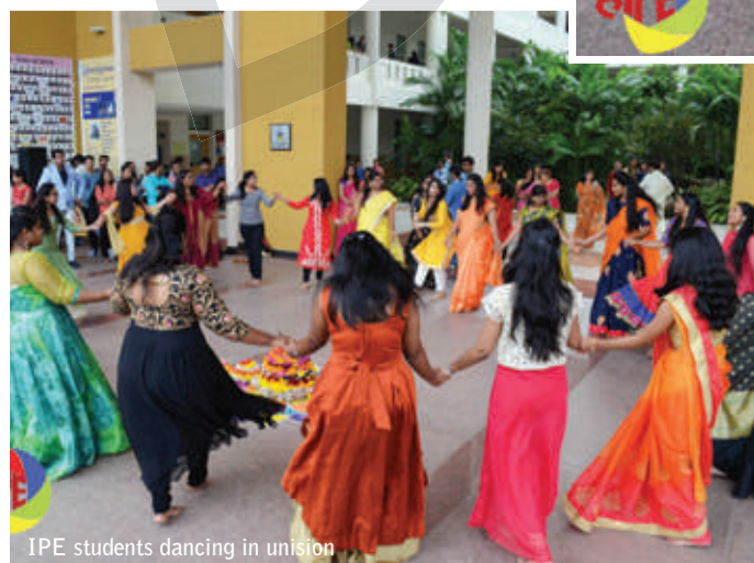
IPE students dancing in unison