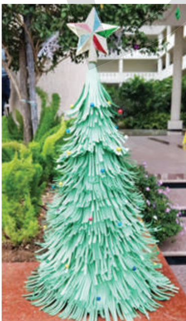
A well decorated Christmas Tree