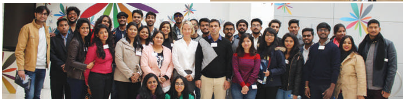
The visiting IPE team with OECD officials