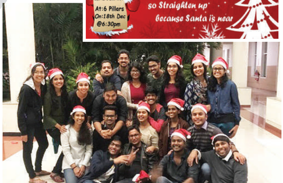
IPE students sporting the Santa Claus Caps