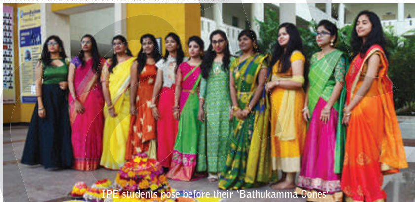
IPE students pose before their 'Bathukamma Cones'

Bathukamma, which reflects Telangana culture is declared as the Telangana State festival by Telangana State Government in 2014. Bathukamma which means 'Mother Goddess Come Alive' is a celebration of seasonal flowers and is celebrated towards the end of the monsoon. A vibrant festival, Bathukamma is celebrated with great enthusiasm by 'the women' in Telangana. They make Bathukamma cones by making use of easily available flowers in their vicinity. Bathukamma is also called a festival of flowers because of the wide usage of the flowers in its celebration.