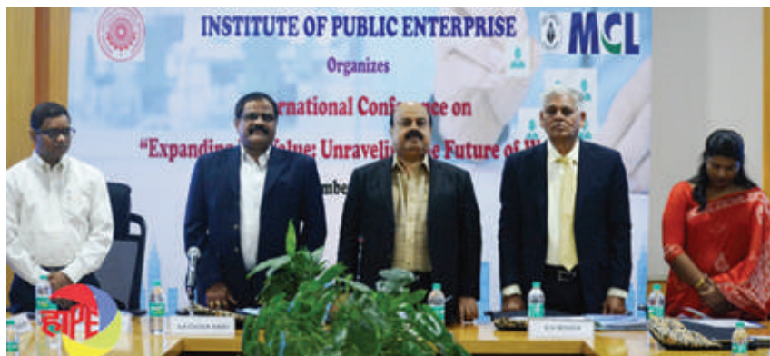
Conference inaugural session underway