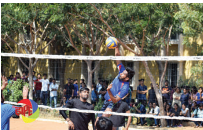
A spiker in action