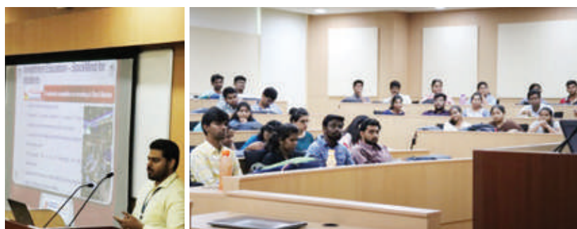
Stock Mind session in progress