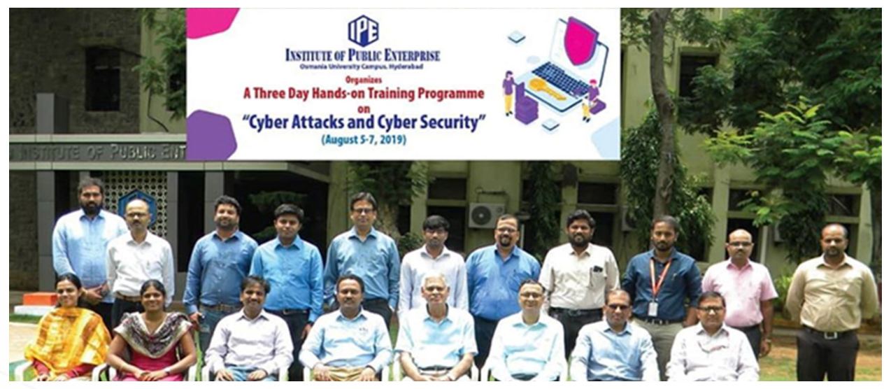
Participants of the training programme "Cyber Attacks and Cyber Security" - August 2019