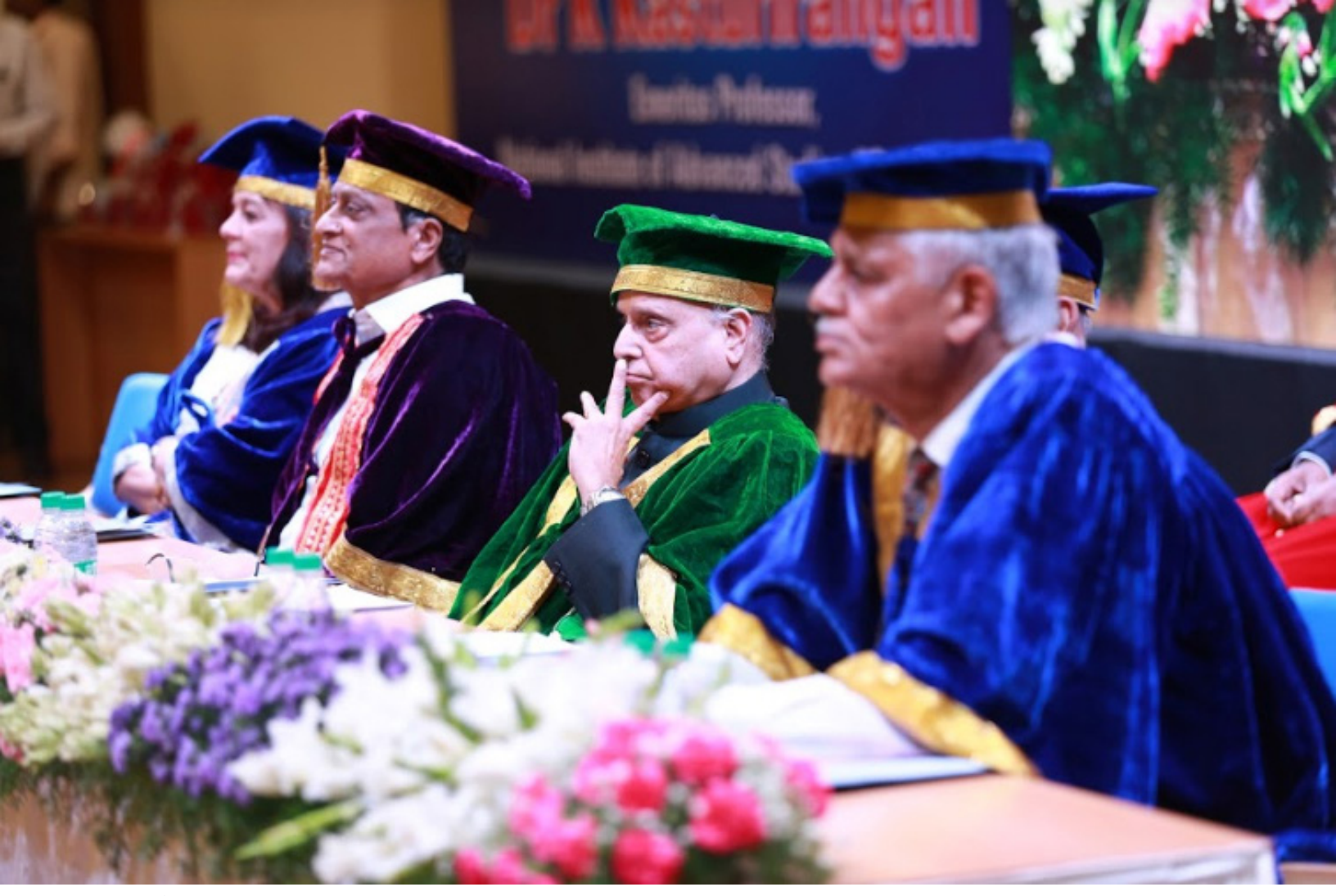
Convocation - IPE