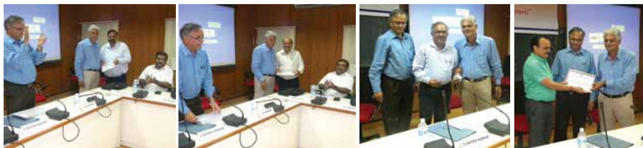
Distribution of Certificates during the Valedictory Session – In-house Programme on “Strategic Enterprise Risk Management” for the Executives of NHPC Limited – September 6-8, 2017