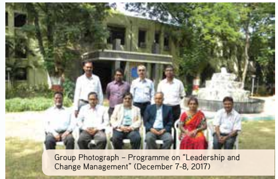
Group Photograph – Programme on "Leadership and Change Management" (December 7-8, 2017)