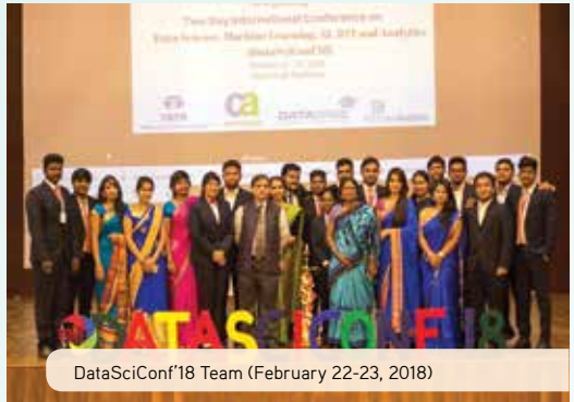
DataSciConf'18 Team (February 22-23, 2018)