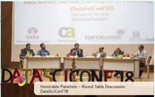
Honorable Panelists – Round Table Discussion DataSciConf'18