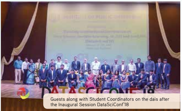
Guests along with Student Coordinators on the dais after the Inaugural Session DataSciConf'18