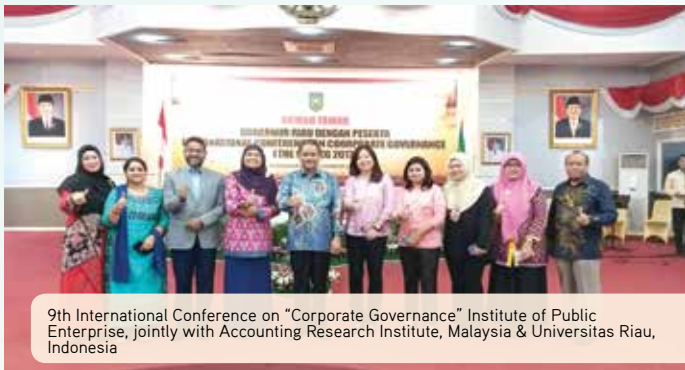
9th International Conference on "Corporate Governance" Institute of Public Enterprise, jointly with Accounting Research Institute, Malaysia & Universitas Riau, Indonesia