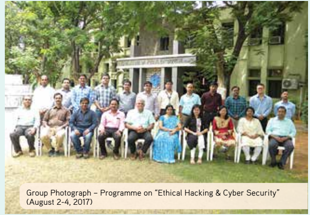
Group Photograph – Programme on "Ethical Hacking & Cyber Security" (August 2-4, 2017)